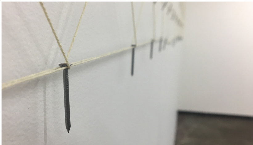
Hold (Detail) , 2018, Ally McKay, nail and string wall installation.

The artists share an affinity to material processes, working with found and sourced materials to create minimal sculpture and installation based work. They draw out the raw potential in their materials, relying on inherent qualities; playing upon and exaggerating strengths and weaknesses to layer meaning within their work. Paying particular attention to the site specificity of the School House Gallery, the artists' works seek to strike a balance between both hiding within the space, and intruding upon it.